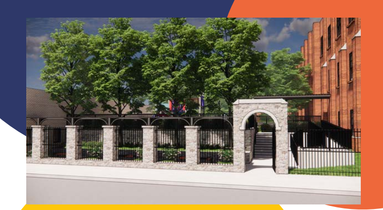
Above: Projected View