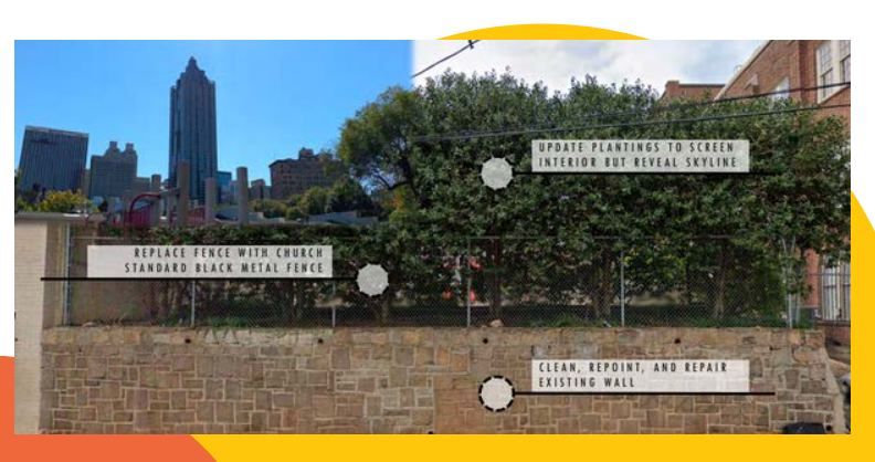
Above: Current View