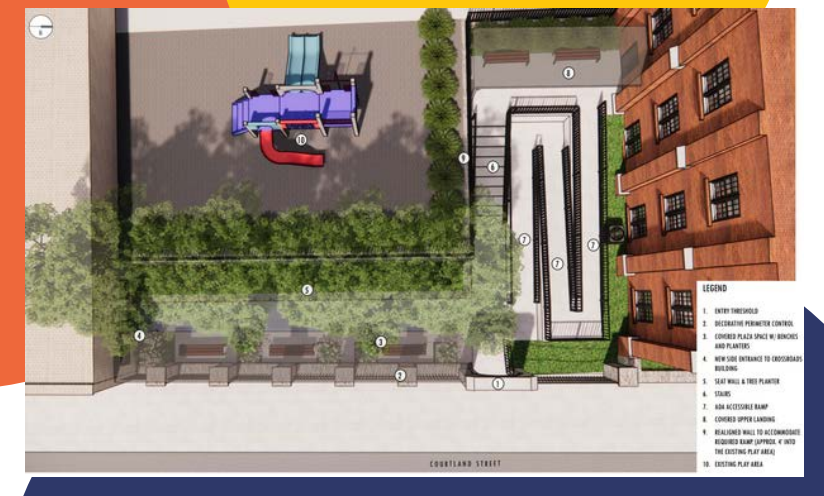
Above: Overhead View