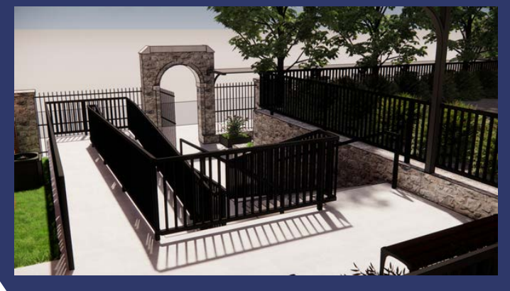
Above: ADA Entrance View