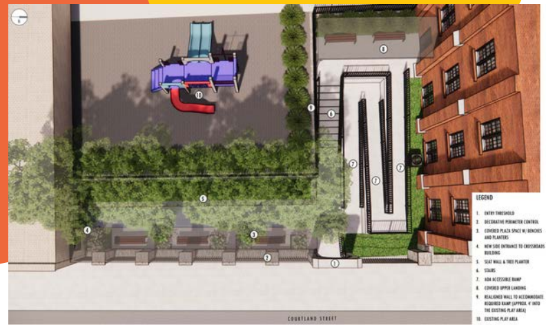
Above: Overhead View