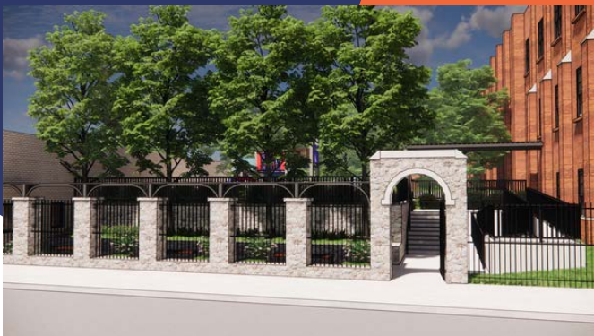
Above: Projected View