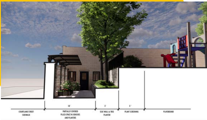
Above: Side View