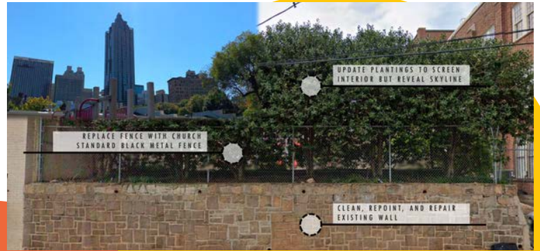
Above: Current View